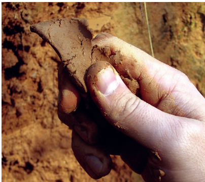
Fig. 2. Can you make a ribbon of soil?

Pick up a handful of soil and you can feel how fine or coarse it is. That feel comes from the size and relative proportion of mineral particles in the soil, and is known as soil texture . The particles that make up soil are categorized into three groups by size: sand, silt, and clay. Sand particles are the largest and clay particles the smallest. (Fig.1) The relative percentages of sand, silt, and clay are what gives soil its texture.