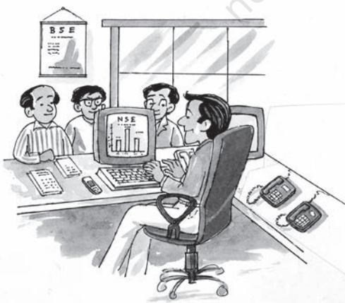
Electronic Trading System