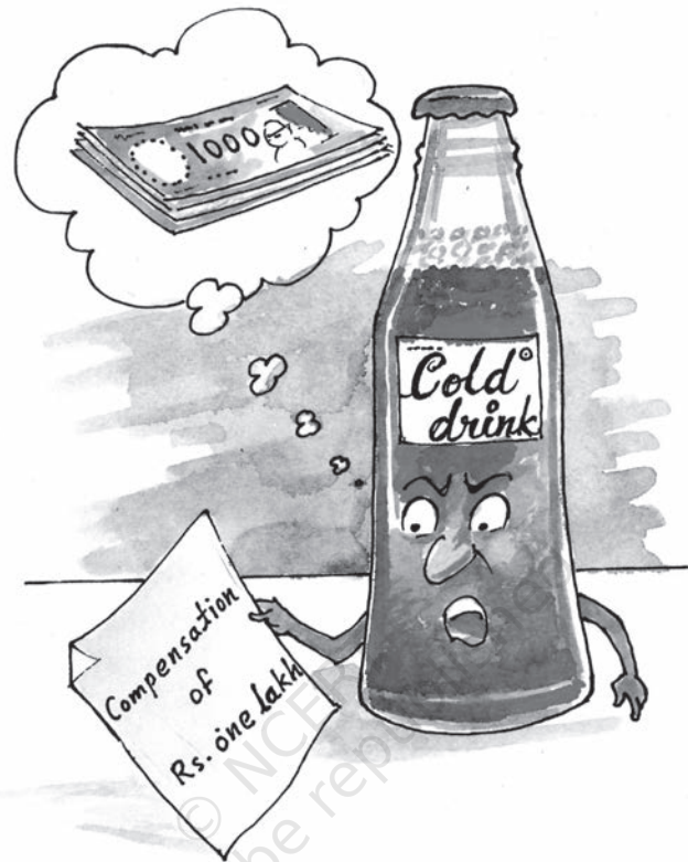
Compensation for impurities in cold drinks

would take care of their interests. Though, in India, we do have consumer organisations which are working in this direction, adequate protection is required to be given to consumers till these organisations become powerful enough to protect and promote the interests of consumers.