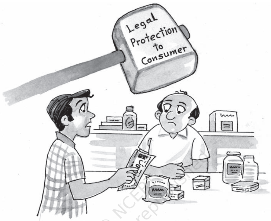
Protection against malpractices and exploitation

remedies available to parties in case of breach of contract.